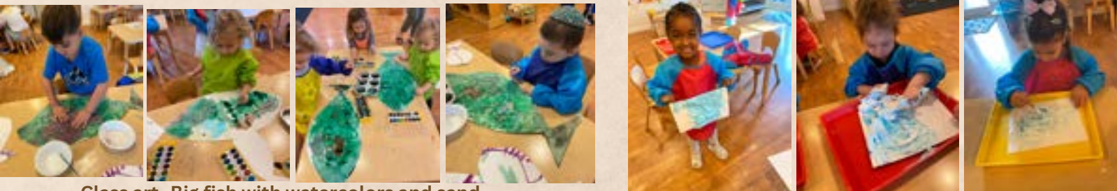
Class art- Big fish with watercolors and sand

Our sensory table was filled with water this week to go along with the Yonah story. One day we made boats out of foil and watched them float in the water. The other days we searched for little fish and played with them in the water.