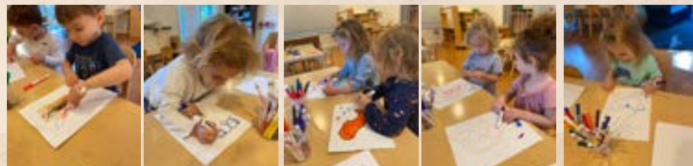
Drawing our Rosh Hashana Reflections

We began the week reflecting about what we did over Rosh Hashana. Each child drew a picture of what he did and hung it up in our art gallery. Over the week the children kept referencing back to their picture and sharing it with their friends. It gave way for great conversations and pride in their own work. This helped us jump into the next holiday of Yom Kippur. We loved learning the story of Yonah and the big fish which is read on Yom Kippur. Here are some other activities we did this week.